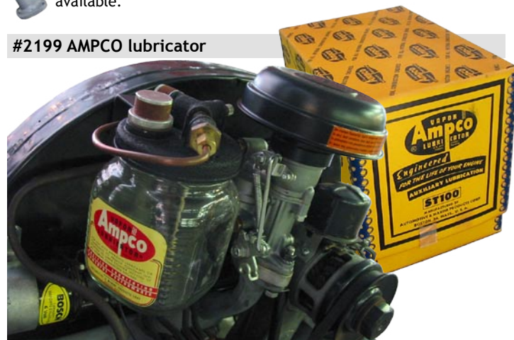
#2199 AMPCO lubricator

The last years there is no more leaded gas for sale in the gas stations. In the seventies it used already to be the case in the USA and they have had a kit developed to assume the lubricating effect of the petrol by sprinkling the oil under the carburettor. The advantage of this kit is not only that you can drive without problems on unleaded gas with the 25-30H.P. engines, but the performance will improve considerably, because the cylinder heads will be greased. Therefore the valves, valves springs, piston and cylinder walls will be always cleaned and lubricated, which extends the lifetime of the engine and will also improve its performance. The use of oil will diminish. Sold per set for 1 engine and stock is already available.