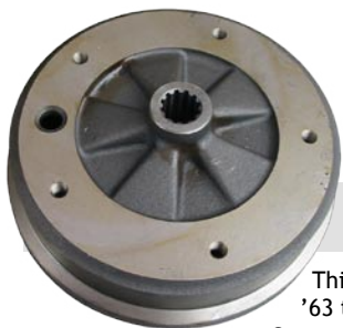
#1282-1 Rear brake drum, Type 3, '63-'67, 5-lugs

This rear brake drum is for type 3 from 08/'63 till 07/'65 and for 5-lug wheels (5x205). Originally they were used from ch. 221 975 till ch. 315 215 000 inclusive. They are sold per piece and there are already some in stock.